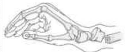
A Colles fracture occurs when the broken end of the radius tilts upward.

The most common cause of a distal radius fracture is a fall onto an outstretched arm.