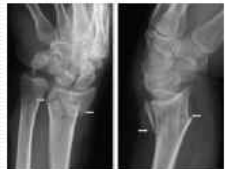
(Left) An x-ray of a normal wrist. (Right) The white arrows point to a distal radius fracture.

There are many treatment options for a distal radius fracture. The choice depends on many factors, such as the nature of the fracture, your age and activity level, and the surgeon's personal preferences.