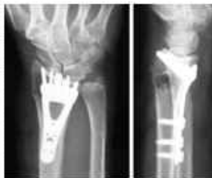
A plate and screws hold the broken fragments in position while they heal.