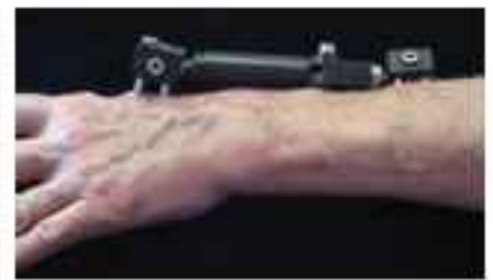
An external fixator.

Your doctor may loosen your cast or surgical dressing. In some cases, working with a physical or occupational therapist will be required to regain full motion.