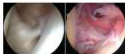
These photos taken through an arthroscope show a normal shoulder joint lining ( left ) and an inflamed joint lining damaged by frozen shoulder.

If you have certain health risks, a more extensive evaluation may be necessary before your surgery. Be sure to inform your orthopaedic surgeon of any medications or supplements that you take. You may need to stop taking some of these prior to surgery.