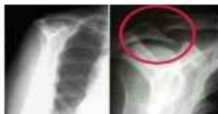
(Left) Normal outlet view x-ray. (Right) Abnormal outlet view showing a large bone spur causing impingement on the rotator cuff.

Steroid injection. If rest, medications, and physical therapy do not relieve your pain, an injection of a local anesthetic and a cortisone preparation may be helpful. Cortisone is a very effective anti-inflammatory medicine. Injecting it into the bursa beneath the acromion can relieve pain.