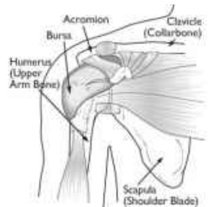
Normal anatomy of the shoulder.

Pain may also develop as the result of a minor injury. Sometimes, it occurs with no apparent cause.