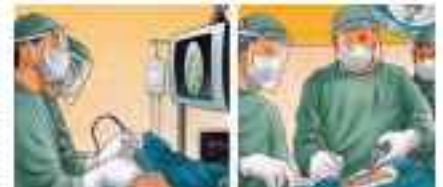
Anterior acromioplasty techniques. (Left) Arthroscopic repair. (Right) Open surgical procedure.

OrthoInfo.org provides expert information about a wide range of musculoskeletal conditions and injuries. All articles are developed by orthopaedic surgeons who are members of the American Academy of Orthopaedic Surgeons (AAOS). To learn more about your orthopaedic health, please visit orthoinfo.org .